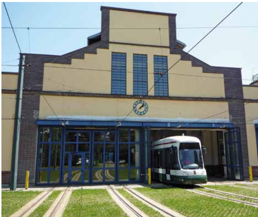
PSITraffic/Depot: Holistic approach as a recipe for success

The integration of a mobile service based on the SMS standard is also in the planning stages. This will provide STAWA employees, specifically in the workshop area, with simplified access to the DMS with fixed workstations, regardless of their location. Mobile DMS operation will be supported by modern Smartphone technology and a special Android application to be developed by PSI. Thanks to more efficient processes in the depot and constant updating of the relevant planners on the status of vehicles, up to the workshop area, STAWA will continue to realise additional savings potential.