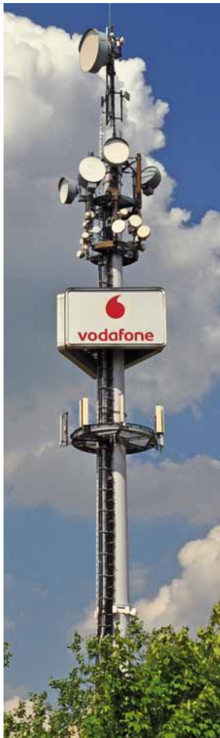
Vodafone OMC tower in Ratingen

Due to its widespread use, the transfer protocol SDH (Synchronous Digital Hierarchy) continues to form a solid foundation for the transmission network. As a third generation transfer protocol, ATM (Asynchronous Transfer Mode) is already well established as a separate network, but is also partially based on the SDH network. The most powerful protocol, DWDM (Dense Wavelength Division Multiplex), plays a significant role in the transmission of larger data volumes in the backbone. It goes with saying that IP (Internet Protocol) is the most widespread of all, be it in the form of