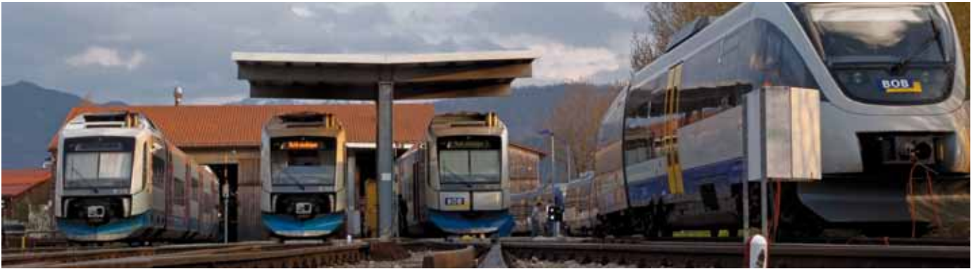
Complex operational procedures as focus of PSI solution concept

The installation of the system in the MoveOn vehicles has already begun and, in keeping with the requirements of the MoveOn project, is already helping to improve passenger information. The newly equipped trains are fully compatible with the existing system when in linked mode, thus enabling problem-free migration to a computer-based control system without operational restrictions. The setup